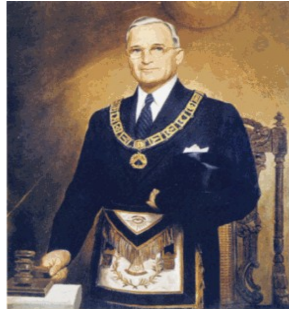
M.:W.:Harry S Truman, Grand Master of the State of Missouri 1940